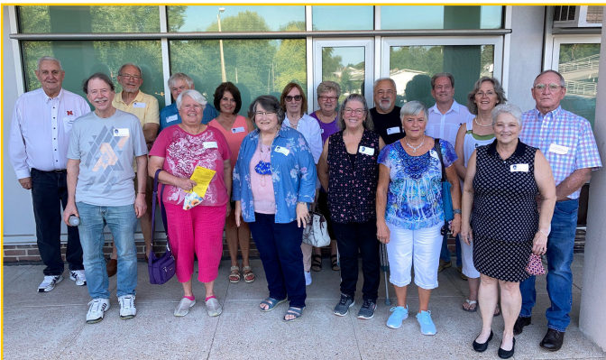
Attendees of the Class of 1964's 57th Reunion