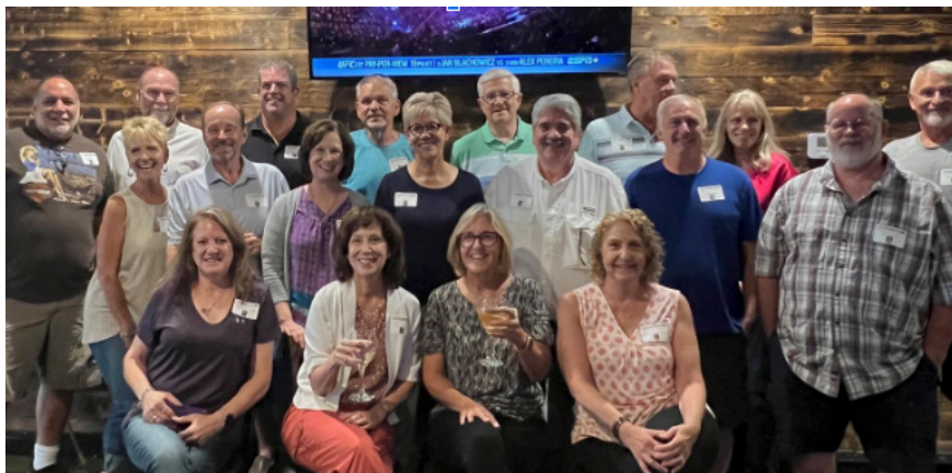
Class of 1973 50th Reunion Photo: Saturday July 29, 2023.